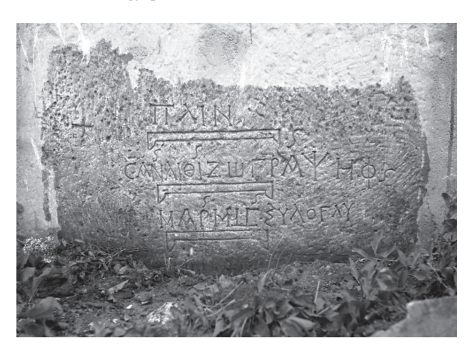
MAMA XI 254: official measures for craftsmen at Laodikeia Combusta

pebble-mosaicists', and the third by 'marble-workers, glass-mosaicists, sculptors'. This stone must be the work of a local Trading Standards Agency, fixing the length of foot in use by different groups of professional craftsmen at Laodikeia. The historical context of this monument may well be the emperor Diocletian's Edict on Maximum Prices of AD 301, which imposed a set of maximum prices on materials and labour for all of the artisans represented on the Laodikeia monument: the prices of bricks, fine marble and sawn timber were now all regulated by the foot. For obvious reasons, every wholesale trader or individual artisan had an interest in arguing that he used a 'short' foot (thereby maximising his profits on any given job); this monument could well have been an attempt to crack down on dodgy practices of this kind.