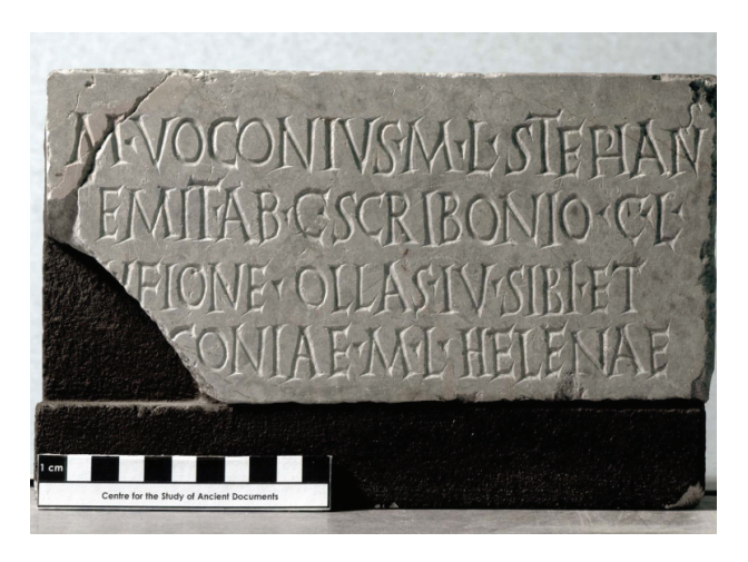
A Latin inscription from the Ashmolean Museum recording the purchase of funerary jars (ollae).

storerooms and on loan to other institutions - to different groups, whether scholars, students, children (particularly at KS2, GCSE and A levels), or visitors.