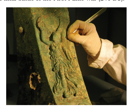
Detail of a Victory on a bronze ship ram from the Egadi Islands Project.