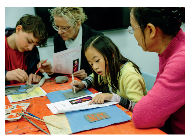
Young visitors at AshLI's 'Remembering the Romans' event, making their own Latin inscriptions.