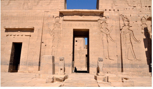
Original location of the 'Philae Obelisk', today situated in the grounds of Kingston Lacy, Dorset.

submerged after the construction of the Aswan Dam. In the 1960s the complex was completely dismantled and rebuilt on the nearby higher island of Agilika, which was reshaped and landscaped to resemble the original Philae. The main temple of the complex, built by the Ptolemies, was dedicated to Isis and became one of the most important religious centres of the country at that time. This is evident from the numerous dedications (royal, high-official and private), which are still preserved on the surface of its walls. We were able to find and record all the Ptolemaic inscriptions situated on the surface of the pylons and on the temple walls and gateways. However, a number of inscription blocks, once attached-in secondary use—to the walls of the courtyard, have been removed and replaced by modern concrete blocks. The present