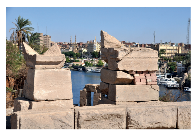
Two inscribed monumental altars at Elephantine.