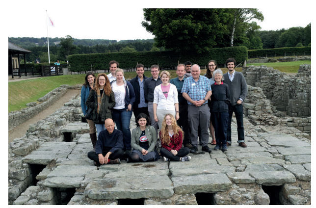
Participants in the 2015 Practical Epigraphy Workshop

At the end of June the CSAD sent a detachment northwards to the Stanegate and to the Roman fort of Corbridge for the 2015 edition of its Practical Epigraphy Workshop.